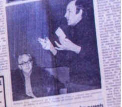
Le président de la Fédération des parents d'élèves de l'enseignement public dans l'Académie de Montpellier